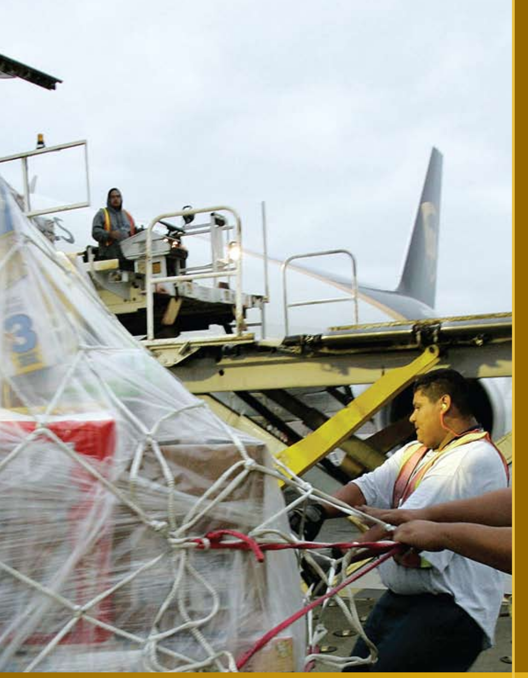
UPS is proud to support the [fill in the blank here].