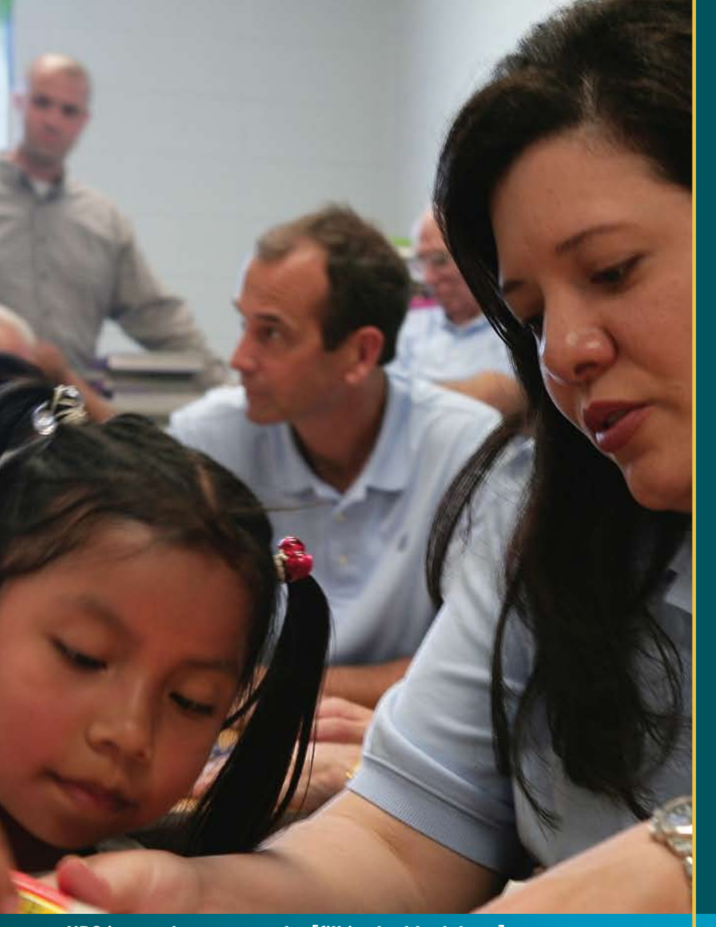
UPS is proud to support the [fill in the blank here].