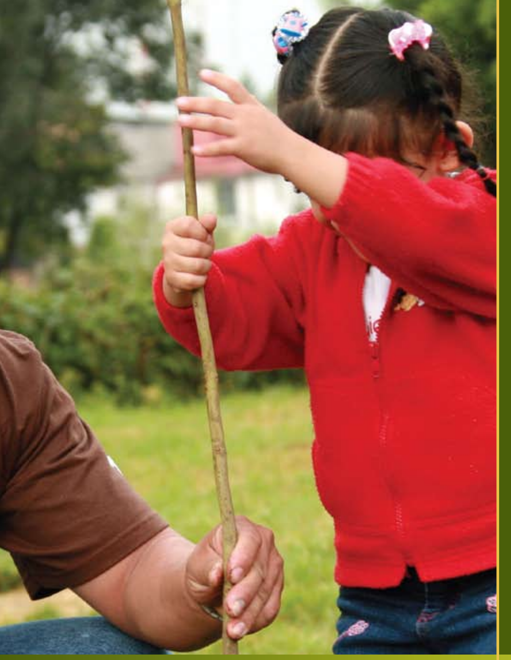
UPS is proud to support the [fill in the blank here].