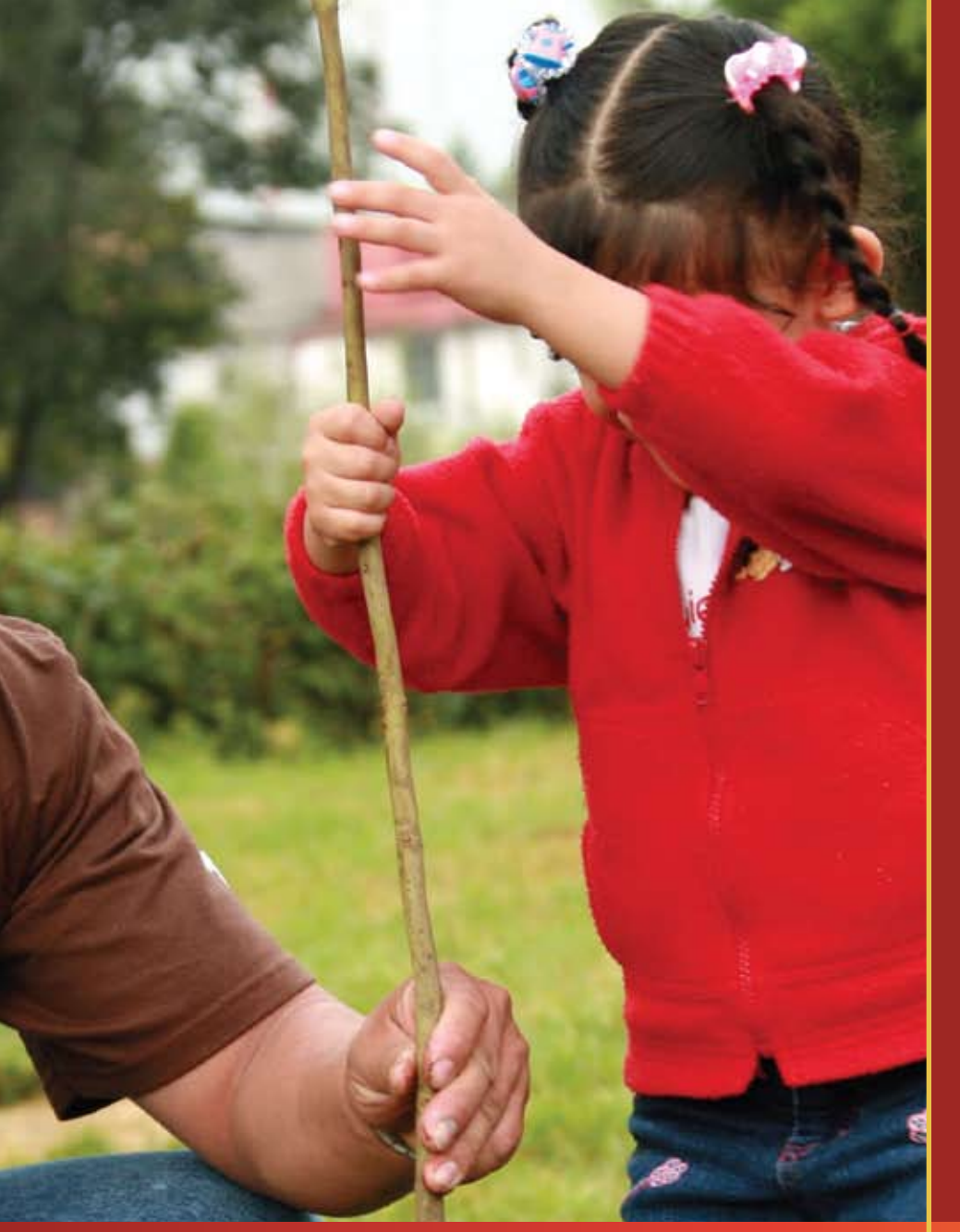
UPS is proud to support the [fill in the blank here].